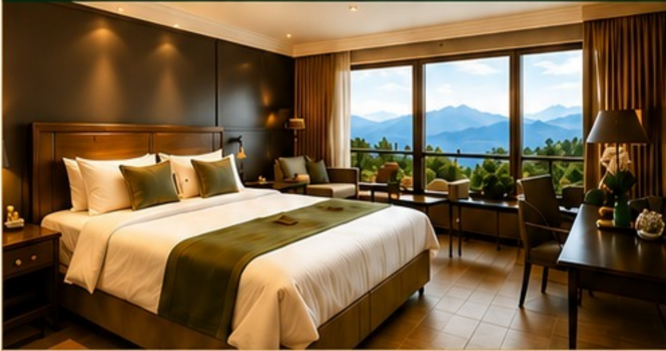
Anutri Hill Resort / Similar