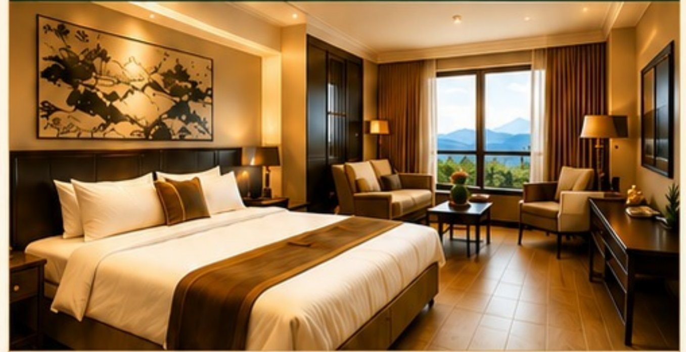
Delisso Abode / Similar